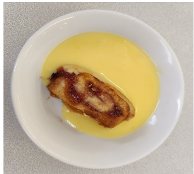
Jam Roly Poly