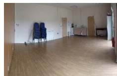
View of the kitchenette (Rear Hall)

Returnable deposit starting at £50 for children's parties (no alcohol allowed)