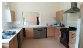
Kitchen (Used for main hall Parties only)