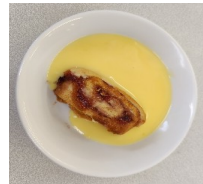
Jam Roly Poly

Call into the centre or ring us on 01438 354662 to book your meal. Office hours to book Mon to Fri 09.30 – 14.45.