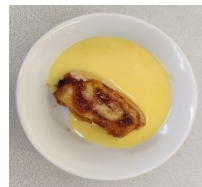
Jam Roly Poly

Call into the centre or ring us on 01438 354662 to book your meal. Office hours to book Mon to Fri 09.30 – 14.45.