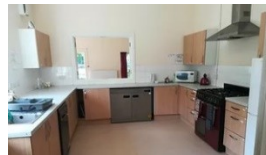
Kitchen (Used for Kennedy Suite Parties only)