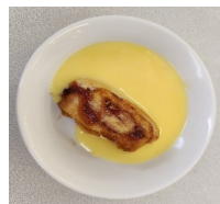
Jam Roly Poly

Call into the centre or ring us on 01438 354662 to book your meal. Office hours to book Mon to Fri 09.30 – 14.45.