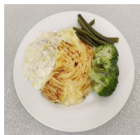
Fish pie & Veg