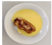
Jam Roly Poly

Our lunch club has grown to what it use to be and it is essential that you book your meal in advance. Sometimes we have to have a cut off point regarding the number of booked meals to the amount of food we have for the meals. Though this doesn't happen very often its just a warning if we say we are unable to book you in.